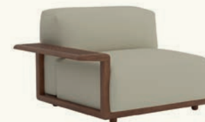
SF2390 Modular sofa with upholstered seat and backrest and structure and armrest (right side) in solid iroko wood.