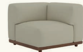
SF2391 Modular corner sofa (left side) with upholstered seat and backrest and solid iroko wood structure.