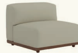
SF2388 Modular Sofa with upholstered seat and backrest and solid iroko wood structure.

Nilo is a modular sofa system that offers great versatility through different versions of straight terminal modules with wooden arm, intermediate, chaise longue, backless or corner seat and table seat. Its construction is based on a solid base of 100% FSC® iroko wood and a backrest structure of treated outdoor steel. The upholstered cushions stand out, generous and comfortable, visually connected to enhance the architectural effect. The distinctive arm, made up of wooden slats, adds character and functionality, allowing efficient water drainage. The detail of its sewing, with an elaborate box-shaped design and made of white thread, becomes an identifying sign of this collection.