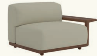
SF2389 Modular sofa with upholstered seat and backrest and structure and arm (left side) in solid iroko wood.