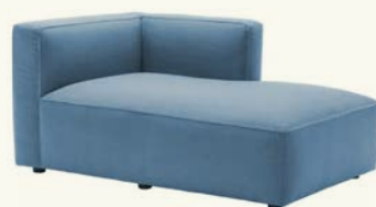
SF2376 Corner sofa (left side) with upholstered seat and backrest. Wide version.