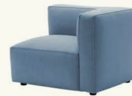
SF2380 Modular corner sofa with upholstered seat and backrest. Left side corner.