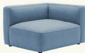
SF2375 Corner sofa (left side) with upholstered seat and backrest. Wide version.