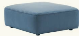
RS2383 Upholstered ottoman. Wide version.