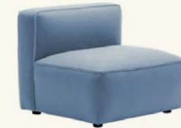
SF2371 Sofa with upholstered seat and backrest.