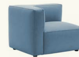
SF2381 Modular corner sofa with upholstered seat and backrest. Right side corner.