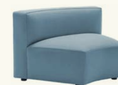
SF2379 Curved modular sofa with upholstered seat and backrest. Closed curved version.