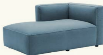
SF2377 Corner sofa (right side) with upholstered seat and backrest. Wide version.