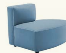
SF2378 Curved modular sofa with upholstered seat and backrest. Open curved version.