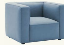
BU2370 Armchair with upholstered seat and backrest.

The Dado Outdoor modular sofa redefines versatility with its exceptional modular concept. This sofa adapts to any outdoor space, offering unlimited and flexible compositions. From seats to corner modules and chaise longues, each piece combines perfectly to create unique configurations. With options such as curved modules and ottomans, this sofa guarantees order and style. The auxiliary cushions complement the collection, providing additional comfort in different sizes.