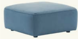
RS2382 Upholstered ottoman.

The collection offers two ottoman module widths to create compositions that define and organize spaces.