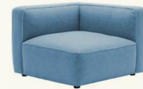
SF2373 Corner sofa (left side) with upholstered seat and backrest.