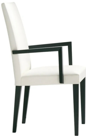
Armchair with upholstered seat and backrest and solid beech wood frame. High back version.