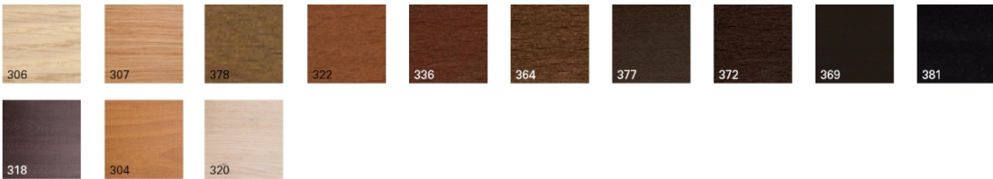
Wood finish Oak